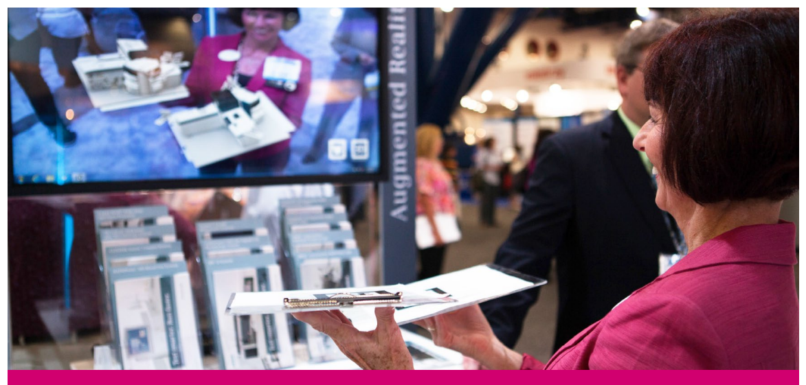
Augmented reality lets audiences see a scalable digital twin of your project or product from their own device, whether at the event or participating virtually.

Offering an omnichannel experience across digital, in-person, and hybrid gives everybody a chance to choose their own adventure and feel comfortable moving between formats as needed.